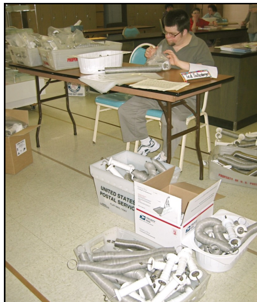
Wrapping assembled parts for shipping to the client.