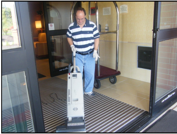
In-training at the Courtyard-Marriot in Greensburg.