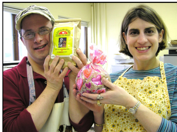
A job well done! The finished product of all natural biscuits in regular and holiday packaging.