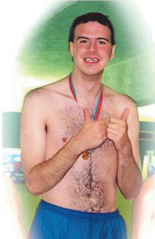
Special Olympic swimming success!

Other in-class activities may include crafts, music and other hands on activities. The program culminates in a large end of year gathering at Hempfield Park in Greensburg.