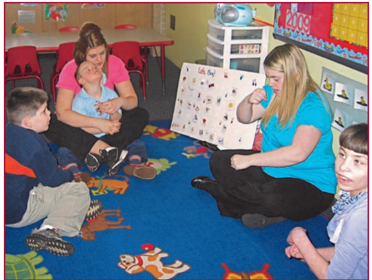
Students incorporate sign language into an activity

Our ability to meet these needs is possible as a result of the donations received by many individuals, businesses, family foundations and corporate grant monies. We are grateful to our supporters and look forward to continued growth and the possibilities that lie in the future.