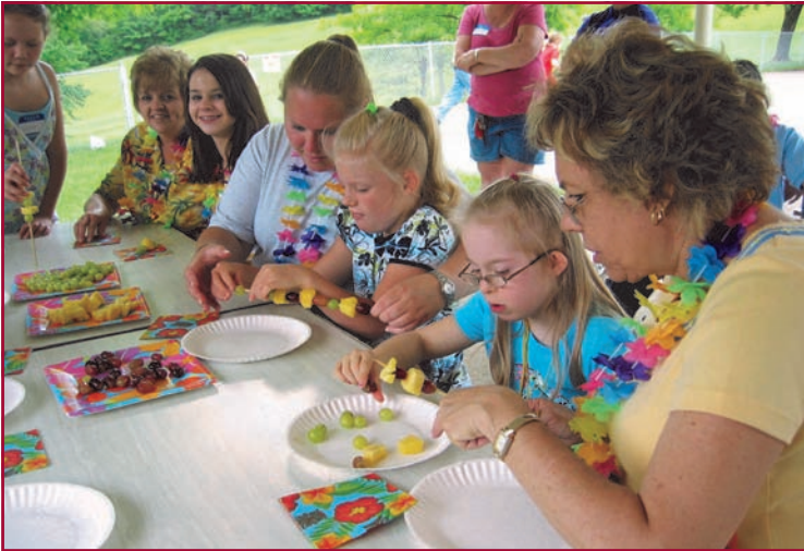
Making fruit kabobs during annual "Carnival Day"

Clelian Heights has become a vibrant community in the deepest sense of the word. It is filled with the activities of contented, happy people learning and enjoying and supporting one another.