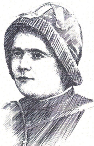
Blessed Clelia Merloni Foundress of the Apostles of the Sacred Heart of Jesus from Whom Clelian Heights Received its Name