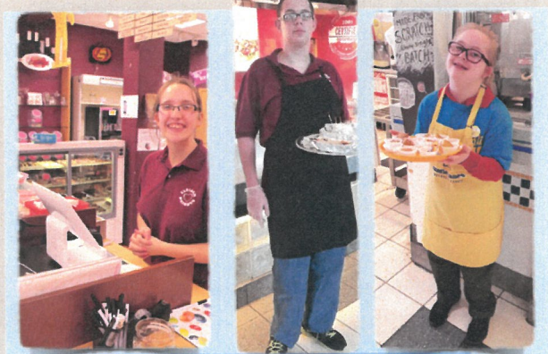
On the Job with Transition-to-Work