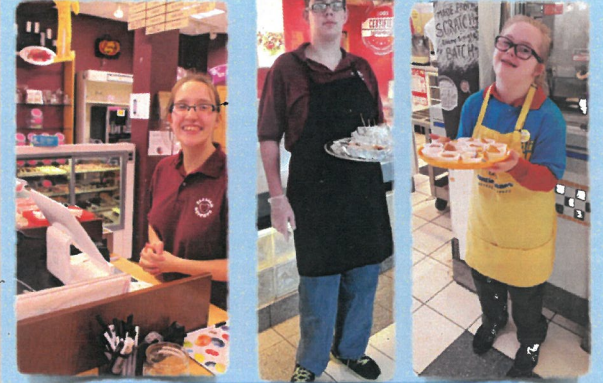
On the Job with Transition-to-Work