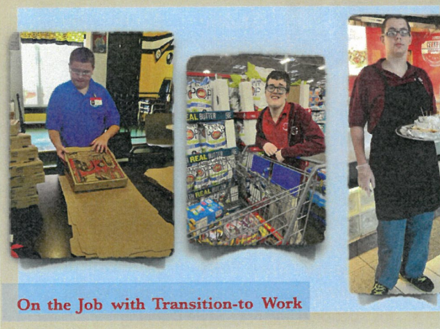
On the Job with Transition-to Work